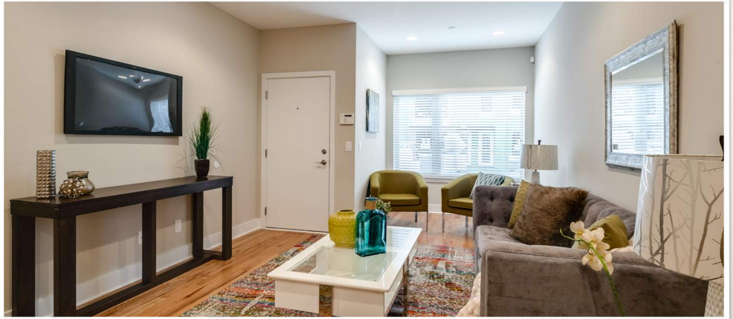
Expansive Great Room Layout